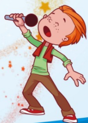
Musical Evening - Participation by Members