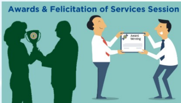
Awards & Felicitation of Services Session