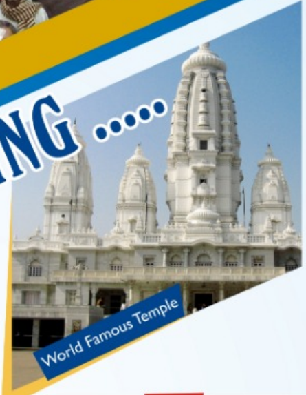
World Famous Temple