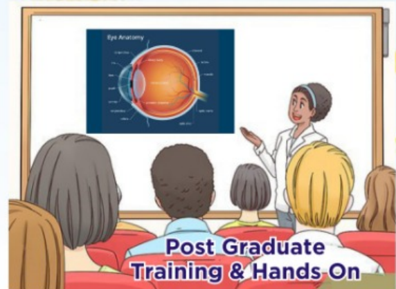
Post Graduate Training & Hands On