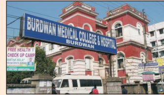
Burdwan Medical College